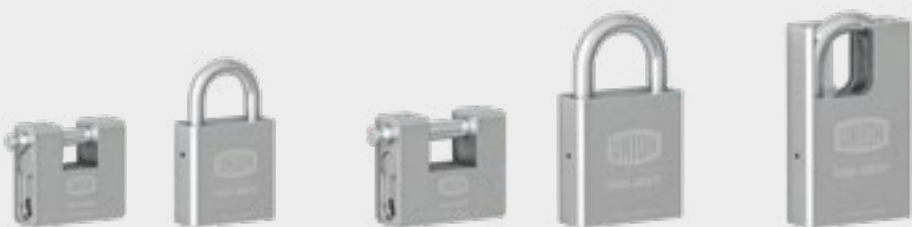
Grade 4 container padlock Grade 4 open shackle padlock

Made from solid hardened steel shackles and bodies which provides resistance to physical attack methods such as cutting, sawing and impact blows. The base features an anti-drill base plate that protects the cylinder from manipulation or a core attack, making the range suitable for different external applications.